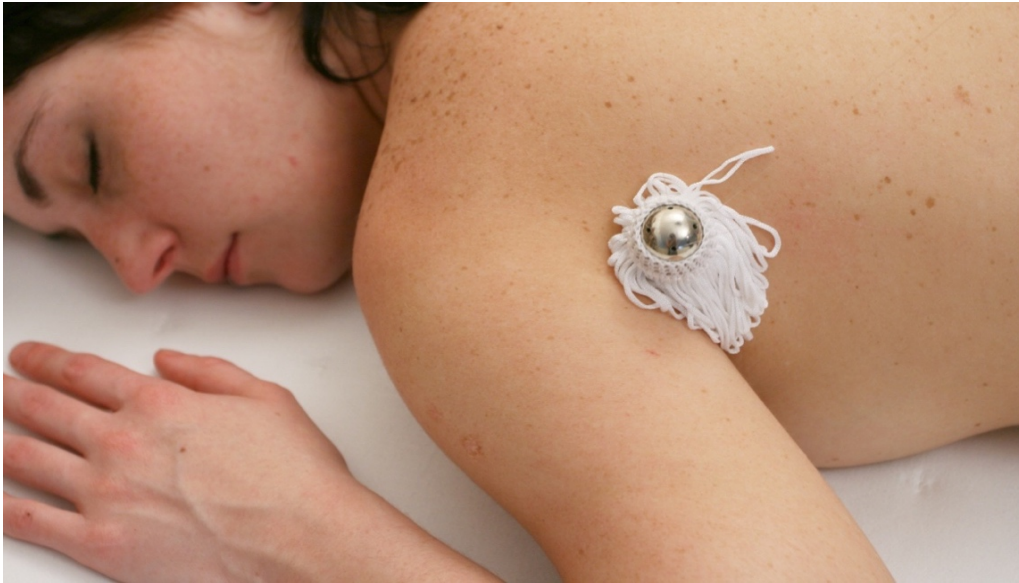
Robot Tickle Salon 2.0.

Another of the proposals that will undoubtedly generate a lot of interest among attendees is the Tickle Salon 2.0. by Driessens & Verstappen , a stroking robot. This interactive art installation allows attendees to lie down and enjoy a pleasant 15-minute stroking session in which the person can indicate to the robot which strokes are most pleasurable to them by means of a two-button control, information that the robot will use to personalise the experience.