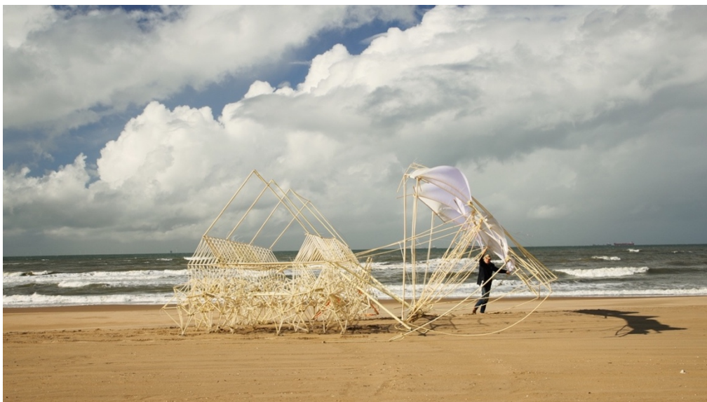
Kinetic sculpture Strandbeest

A piece that will leave no one indifferent is the impressive large-scale kinetic sculpture Strandbeest , by Theo Jansen , a performance by engineering work that moves imitating the movements of living organisms by harnessing the power of the wind, which will be touring CAN REON at different times during the festival.